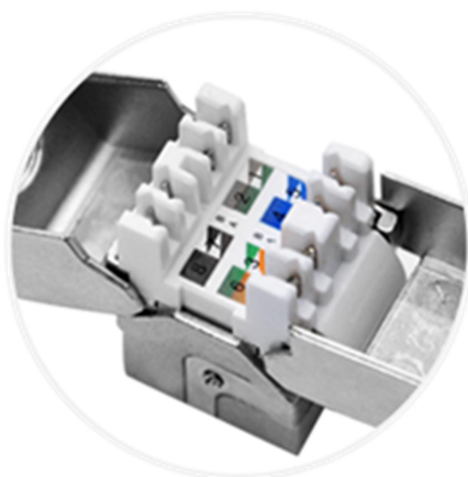
T568A/B Wiring Scheme Colour-wiring diagram for ease of installation