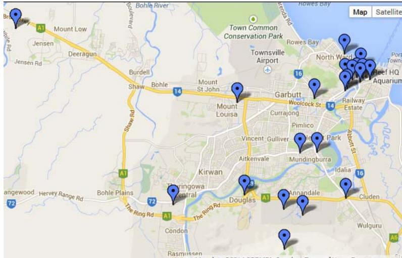
Diagram 1: Hotspot locations map - Townsville

Yourhub users can easily locate other Yourhub hotspots by viewing our locations map located on our website.